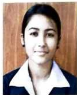
FEBA JOY 1 st Sem CS - 78.80%