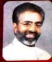
Cordial prayerful greetings of CHRISTMAS AND NEW YEAR

Christmas is the feast of families. A just father, Joseph and a Humble mother Mary lived for child Jesus. That was the story of the Holy Family which remains continually the model for all families. What united them was love. Christmas is a clarion call to love each other, by respecting each other and by serving each other.