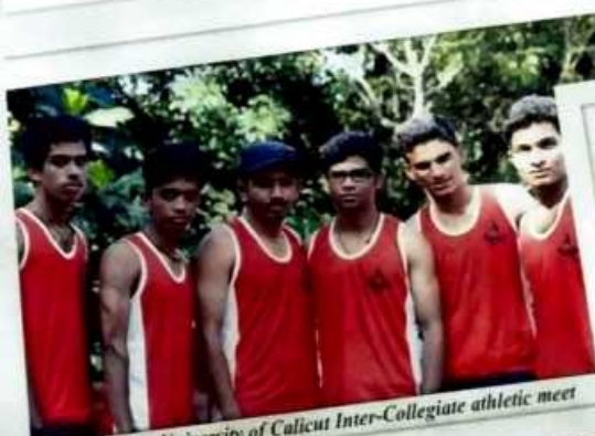
Athletic Team for University of Calicut Inter-Collegiate athletic meet