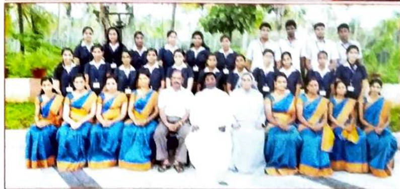
Behind Laureola: BCA Department