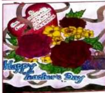
Prize winning Card