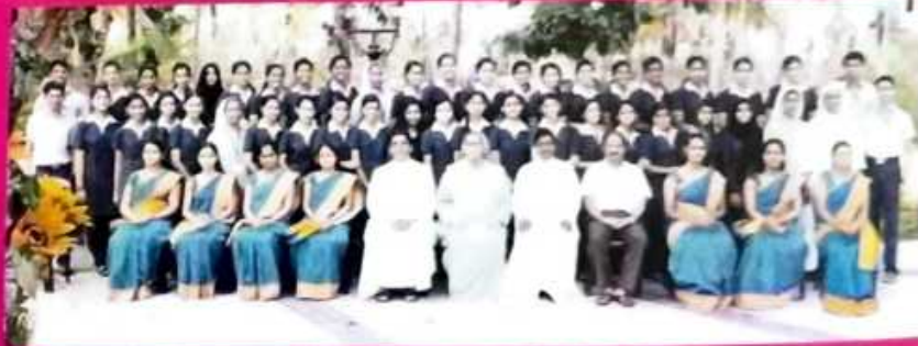
Department of B.Sc. Psychology