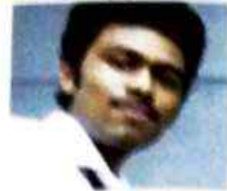
Western music (Solo)