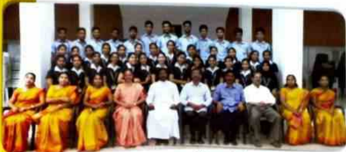
Behind the Laureals - Department of Physics & Chemistry

Within each of us lies a burning desire to make our lives and time on earth something truly special. We want to achieve our goals & make one's fondest dreams come true in fact. We don't just want to attain these lofty aspirations, fulfill our destinies, we need to make them happen. We "The best preparation for tomorrow is doing your best today"